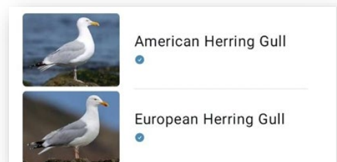
Herring Gull Split

These taxonomy changes happen annually in October, so I plan to be ready next year (exporting my list from eBird before the update, to make it easier to see what changed)!