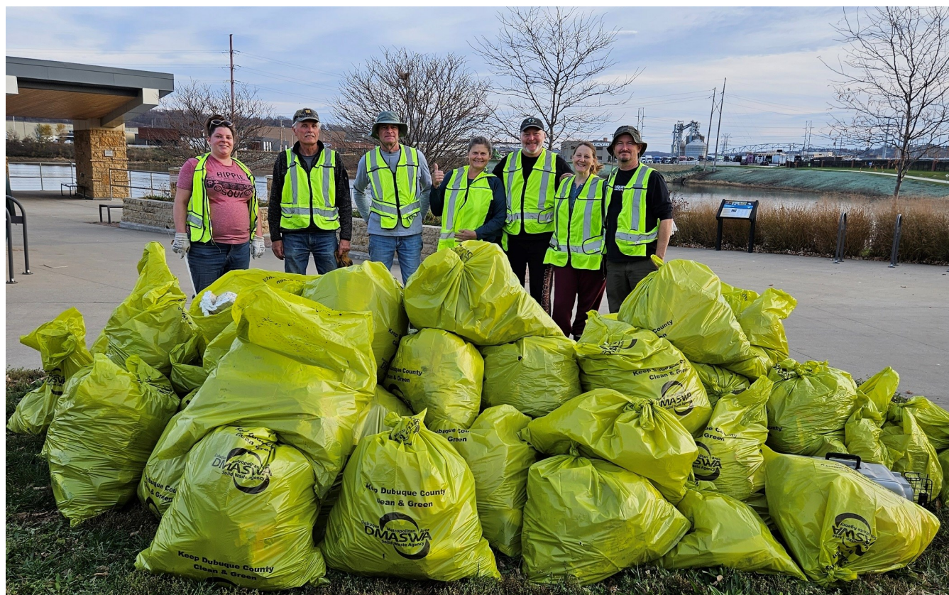
Cleanup at 16th Street Retention Basin (November 19, 2023)