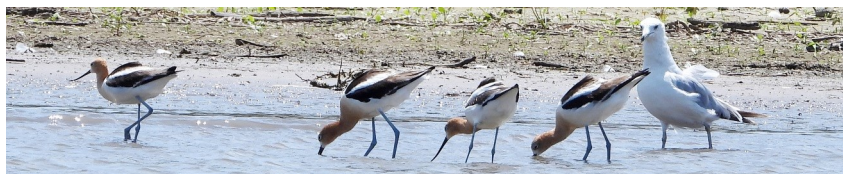
American Avocets with Ring-Billed Gull at A.Y. McDonald Park in July