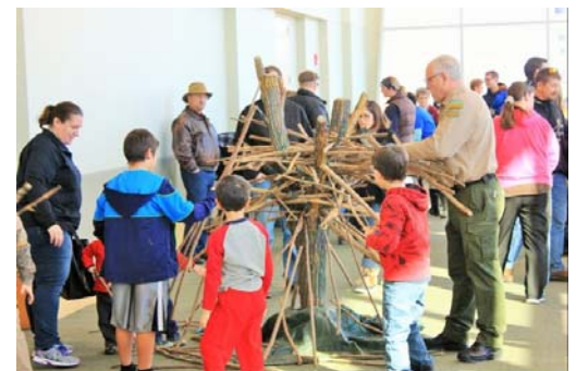
Bald Eagle Watch