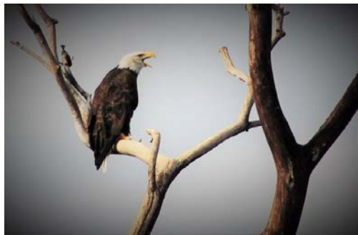
Adult Eagle