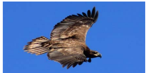
'Bald Eagle (immature)

Our big sit was on Saturday September 12 th and ran from 5:30 a.m. until 8:00 p.m -- a whopping 14 ½ hours! In that time we identified 57 species of birds including: 6 types of Woodpeckers, 3 types of Vireos, 4 types of Swallows and 13 types of Warblers. All of this was seen from the sidewalk around the Julien Dubuque Monument. Throughout the day we had 65 people stop to visit us, including a gentleman from Bellevue and one group that came all the way from Madison, Wisconsin. Not only was it a Big Sit, but it was a big day!