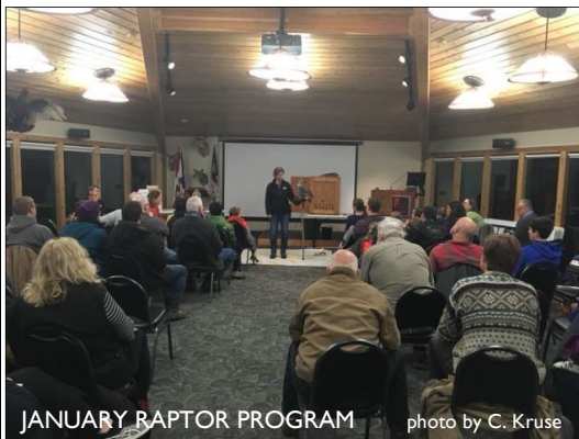
JANUARY RAPTOR PROGRAM

We lined up the Iowa Raptor Project (from the Iowa City area) to bring some live birds